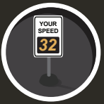
Radar Speed Signs