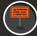
Noise, Dust & Vibration