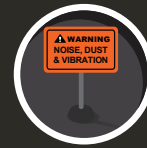
Noise, Dust & Vibration